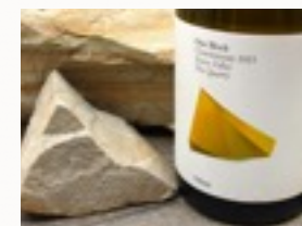
Wines crafted by the earth in

WE LIKE TO BE CREATIVE, EXPLORE AND ENJOY OURSELVES. WINE IS ALL ABOUT ENJOYMENT. GROWING GRAPES ACCORDING TO WHAT'S BEST FOR THE SOIL, VINE, AND ULTIMATELY THE FRUIT IS OUR ENDEAVOUR WE MAKE WINE USING OUR SENSES, NOT RECIPES, THAT RESULT IN WINES THAT SPEAK OF PLACE.